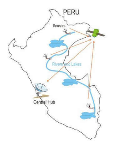
Figure 1. Mission concept. Data from polluted water is sent to a Central Hub in Lima through satellites.

utes. The sensors send the retrieved information, as shown in Fig. 1, through Earth communication systems, to satellites forming a constellation using an store-forward communication mechanism.